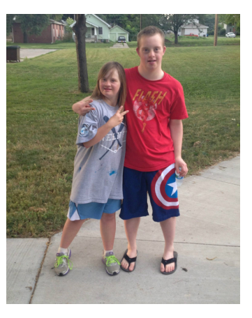
July 24, picnic and swim party