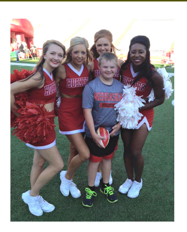
Sept. 13, Husker Heroes