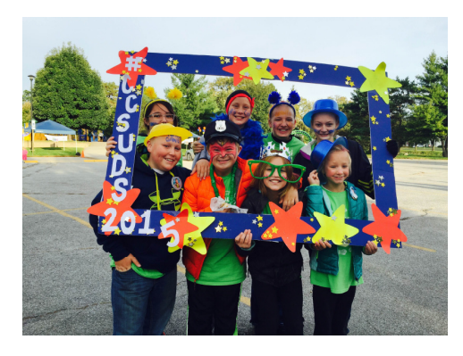
Oct. 3, Capital City SUDS walk