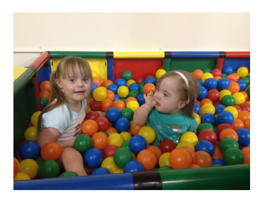
Aug. 22, 'Lil Stars at the Ager Center