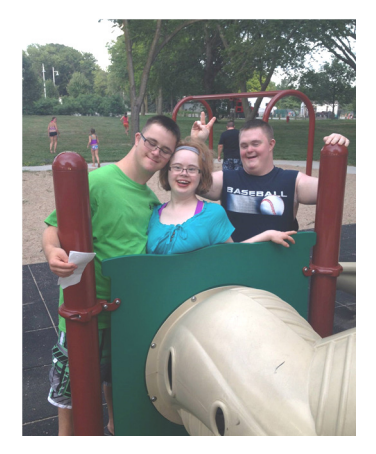
July 24, picnic and swim party